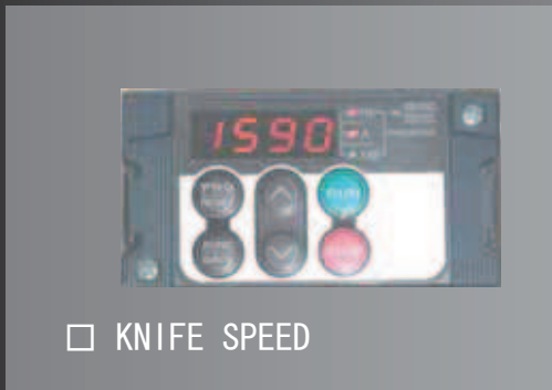
□ KNIFE SPEED