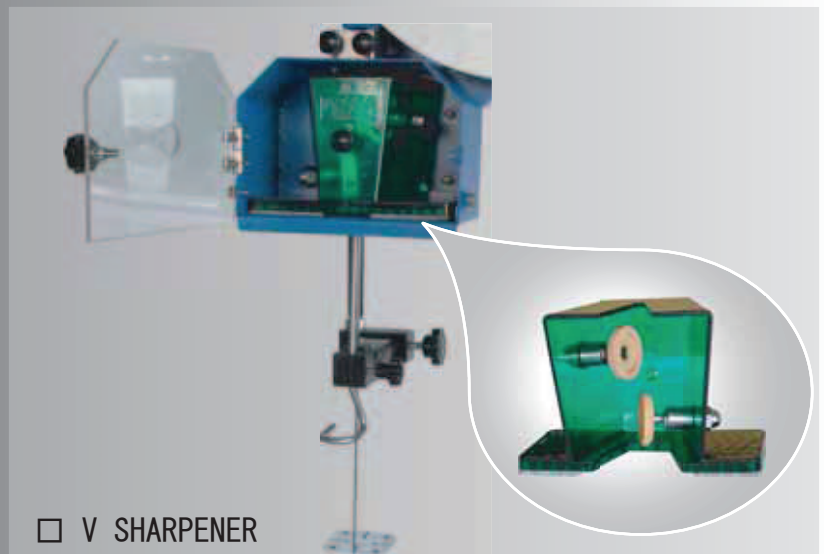
□ V SHARPENER