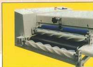
旋轉式撥片 Rotary stripe-off