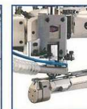
自動剪線裝置 Chain cutter by Air.