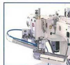
吸布肩裝置 Venturi device