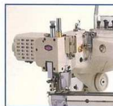
直驅分離式伺服馬達 Direct drive servo motor

Front hand wheel design for clutch motor equipped head.