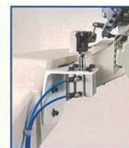
氣動式抬腳裝置 Auto lifter by Air