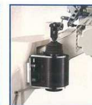
電動式抬腳裝置 Auto lifter by Electric