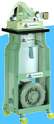
Table-top thread trimmer. Easy to operate. Powerful and quiet suction motor with waste collector. Easy to assemble, without table and stand